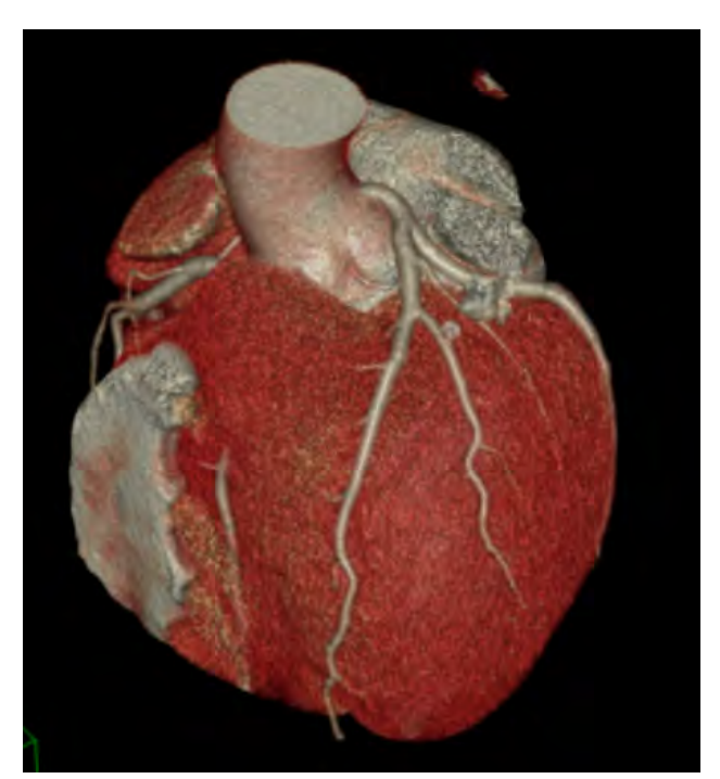
A 3 dimensional computed tomography scan of the coronary arteries performed at MetroHealth.

Visit metrohealth.org/heart-risk for more information on prevention tests.